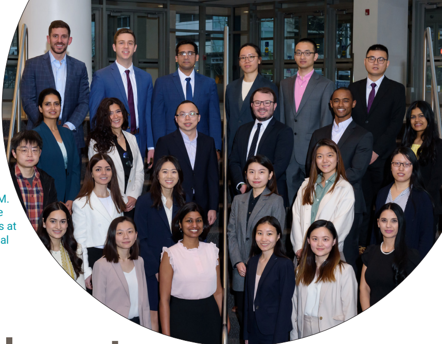
Retina Research Foundation/Joseph M. and Eula C. Lawrence travel grant recipients at the ARVO 2022 Annual Meeting