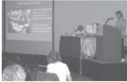
Staff from NIH Center for Scientific Review (CSR) conduct a workshop during the ARVO 2003 Annual Meeting to explain the CSR's Role in the grant application review process.

For more information about NIH grants, visit www.grants.nih.gov/grants/oer . To learn more about the Center for Scientific Review, go to www.csr.nih.gov . Watch for the CSR session at the 2004 Annual Meeting.